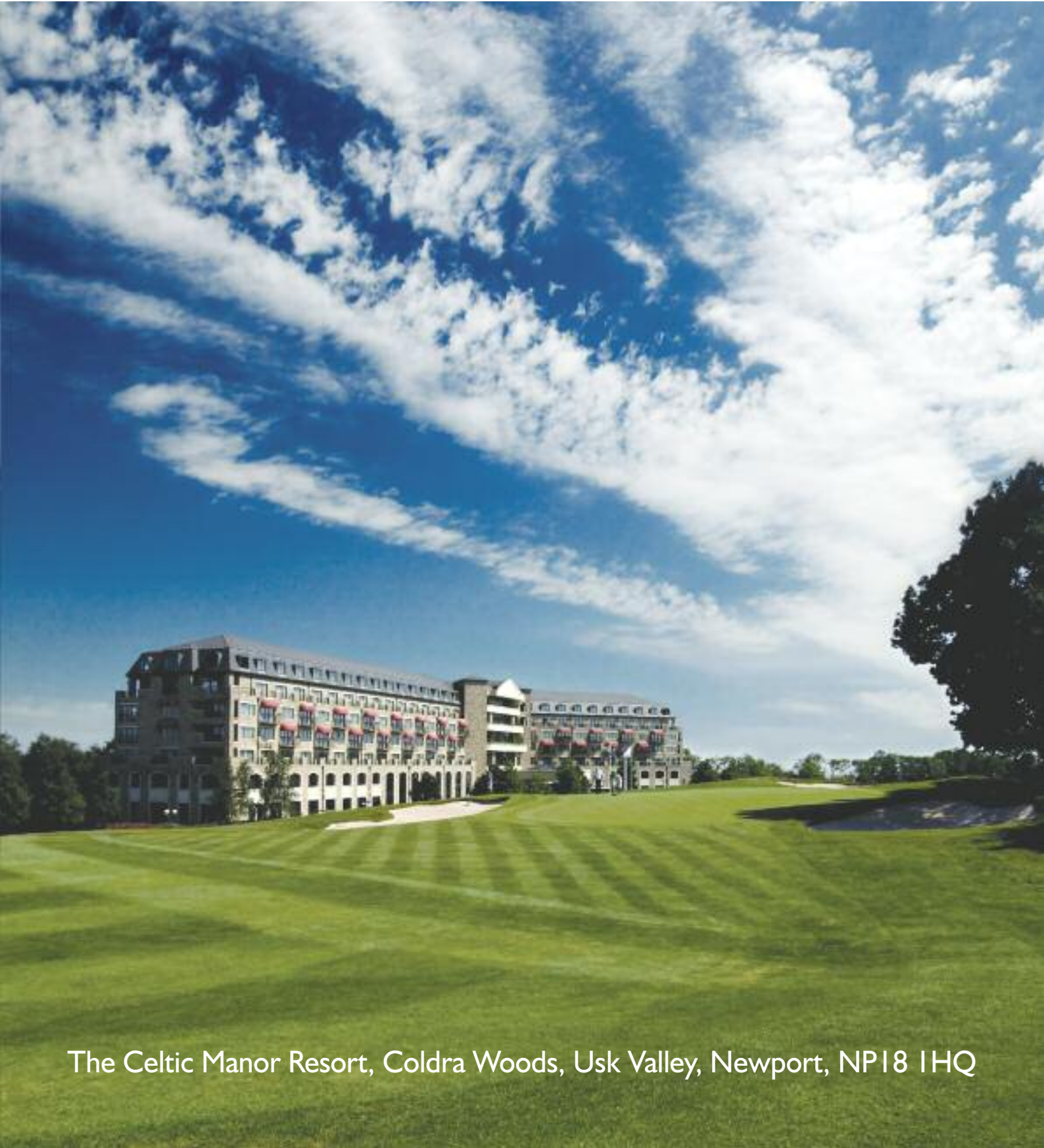
The Celtic Manor Resort, Coldra Woods, Usk Valley, Newport, NP18 1HQ